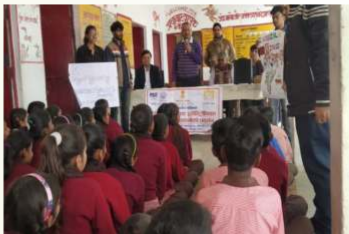
Faculty members and students explaining new ideas to school students in a village

The IEI Students' Chapter of Department of Electronics & Communication Engineering of PSIT College of Engineering organized an essay and quiz competition on 13 January 2020 on the occasion of Swami Vivekananda Jayanti. The Chapter also organized collage making competition on the theme 'Incredible India' on 29 January 2020. For enhancing and promoting skill development, the students visited a nearby village. A technical exhibition was organized by them to showcase their projects and ideas to school children on 8 Feb 2020.