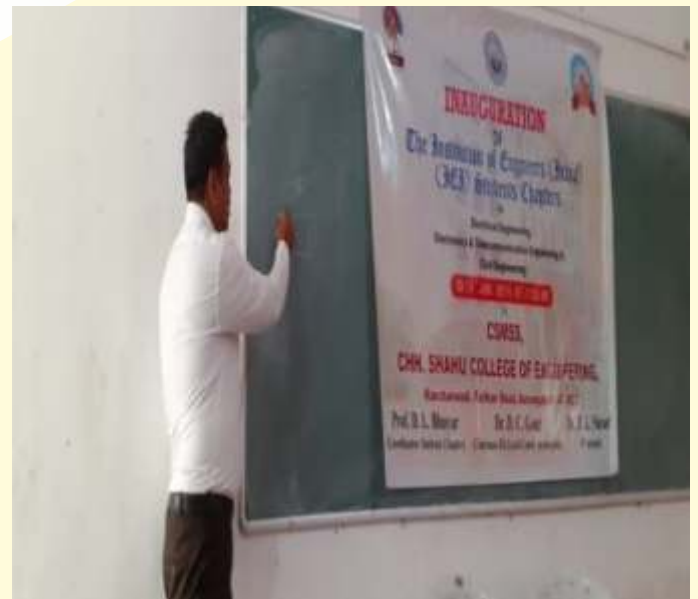
Speaker during the expert lecture on 24 February 2020