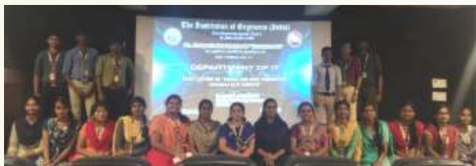
Participants during the guest lecture