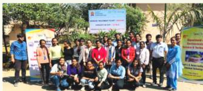
Get-together of the participants during an industrial visit

The IEI Students' Chapter of Department of Environmental Science & Technology of Shroff S.R. Rotary Institute of Chemical Technology, Jalgaon organized expert lectures on (i) 'Cleaner Production' on 26 December 2019 (ii) 'EIA AUDIT' on 30 December 2019 (iii) 'Solid waste Management' on 30 December 2019 (iv) 'Industrial Time Management' on 31 December 2020 (v) 'Overcoming Barriers to attain accessibility to opportunities in Education and Life' on 4 January 2020 (vi) 'Wastewater Treatment' on 6 January 2020 (vii) 'Industrial Wastewater Treatment' on 7 January 2020 (viii) 'Sustainable Development and Green Technology' on 7 January 2020 (ix) 'Waste Management' on 6 February 2020 and (x) 'How to face interview' on 15 February 2020. The Chapter also arranged industrial visits to (i) Narmada Clean Tech. (NCT), Ankleshwar on 31 December 2019 (ii) Tagros Chemicals India Pvt. Ltd. on 6 January 2020 (iii) Bharuch Enviro Infrastructure Ltd. on 9 January 2020 and 13 January 2020 (iv) Sewage Treatment Plant of Surat Municipal Corporation (SMC), Surat on 4 February 2020. The Chapter in association with Nature Club of SRICT jointly organized presentation competition 'Let's Talk' on 18 January 2020 and two One Day Workshops namely 'Analysis of Water/Wastewater Parameters' on 20 January 2020 and 'Pollution Prevention in Chemical Industry' on 28 February 2020.