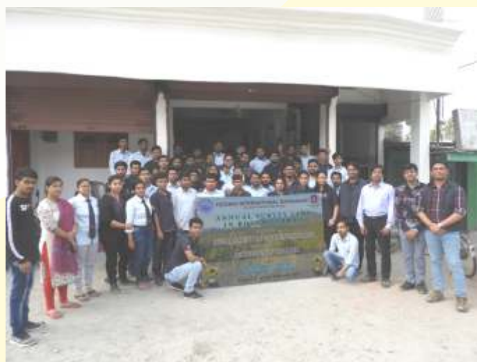
Get-together of participants during the Annual Survey Camp

Annual Survey Camp (Survey using Total Station) was organized by Department of Civil Engineering of Techno International Batanagar with the collaboration of IEI Students Chapter, held from 17 February-22 February, 2020 at Madarihat, Dooars of Alipurduar District.