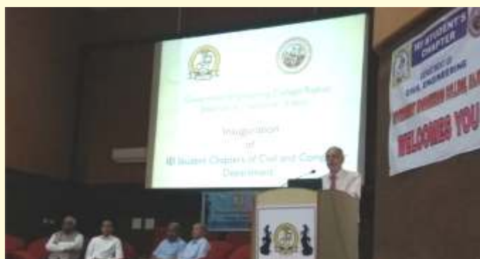
View of the dias during the inaugural program

The IEI Students' Chapters were inaugurated in Department of Civil Engineering and Computer Engineering in Government Engineering College Rajkot on 1 February 2020.