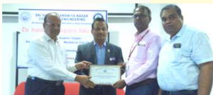
Handing over of the Students' Chapter certificate during the inaugural session