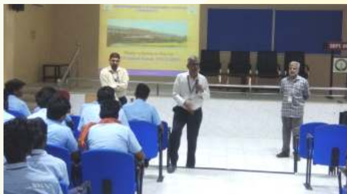
Speaker during the Guest Lecture on 'Opportunities in Higher Education for Polytechnic Students'