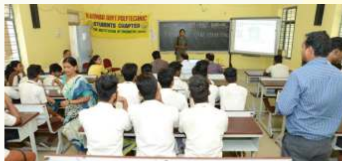
View of the participants during the technical quiz

The IEI Students' Chapter of Government Polytechnic, Karwar conducted technical quiz on 6 March 2020 in collaboration with Girijabai Sail Institute of Technology, Karwar. The Chapter also organized a Technical Expert Guidance Program during 11-12 March 2020 for the final year Diploma students.