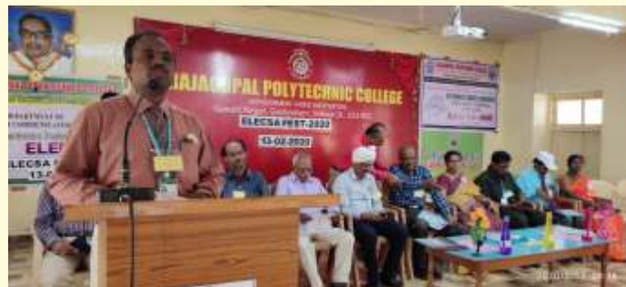
View of the dias during the inaugural ceremony

The IEI Students' Chapter of Rajagopal Polytechnic College organized a 'State Level Technical Symposium' on 13 February 2020.