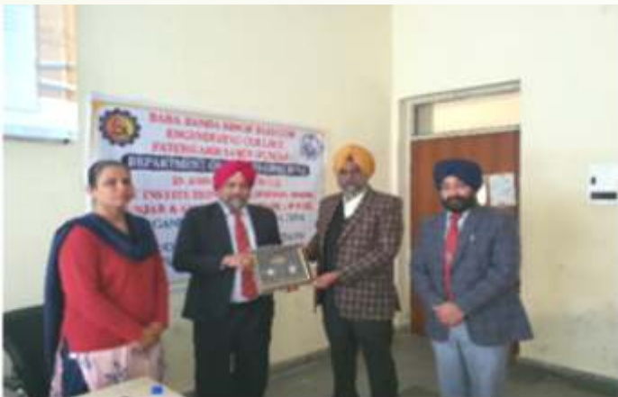
Presentation of memento to the speaker during the Expert Lecture