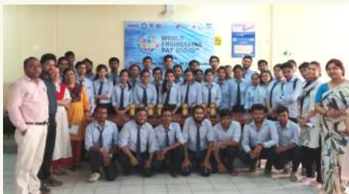
Participants during the activities on World Engineering Day