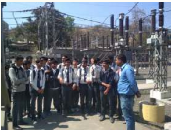
Participants during the substation visit

The Chapter has also organized a paper presentation competition for the students on 13 February 2020