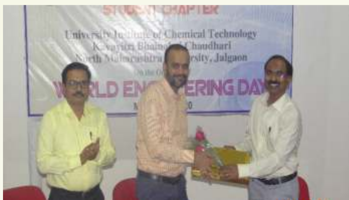
View of the dias during the inaugural ceremony

The Chapter also celebrated Women's Day on 7 March 2020 at University Institute of Chemical Technology under Equity Action Plan sponsored by TEQIP-III.