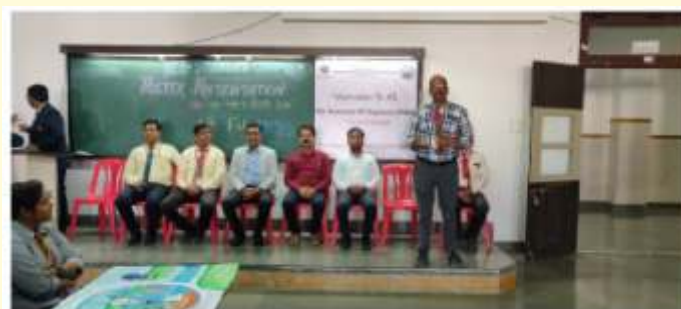
View of the dias during the poster presentation

The IEI Students' Chapter of Department of Mechanical Engineering of Sandip Institute of Engineering & Management, Nashik organized inter-college level Poster Presentation Competition titled 'The Recent Trends in Renewable Energy Sources' on 18 February 2020.