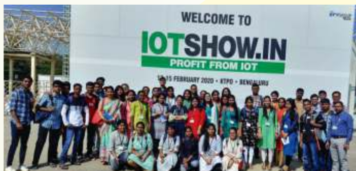
Participating students with faculty members at IoT show-2020, KTPO, Bengaluru

The Students' Chapter of Department of Information Science & Engineering of B.N.M. Institute of Technology organized a visit to 'IoTshow' at Karnataka Trade Promotion Organisation (KTPO), Bengaluru on 15 February 2020 as a part of industrial visit to learn about the IoT and automation process in an industry. The students had an opportunity to interact with different companies and learn about the lifecycle of product development, importance of innovativeness, the financial and marketing phase of product development.