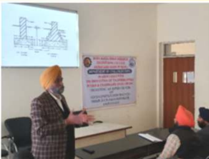
Speaker delivering the Lecture