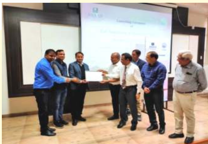
View of handing over of the Students' Chapter certificate