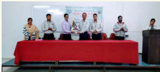
View of the dias during the expert lecture