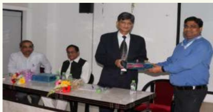
View of the dias during the inaugural program

one day technical poster presentation and a one day Robotics event on this occasion. The chapters also conducted a technical quiz contest later.