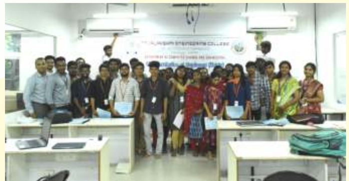
Participants during the workshop

The IEI Students' Chapter of Computer Science and Engineering Department, Rajalakshmi Engineering College, Chennai have conducted a Two Day Workshop on 'Artificial Intelligence and Deep Learning' during 9- 10 March 2020.