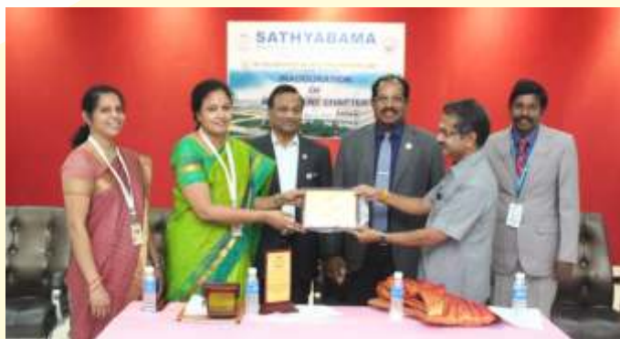
View of the dias during the inaugural program