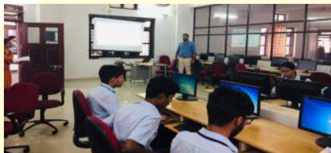
View of the participants during the workshop

The Students' Chapter of the Department of Computer Science Engineering of Saintgits College of Engineering organized a Seminar on 'Network Packet Analysis using WIRESHARK' on 6 March 2020 as a part of World Engineer's Day Celebration.